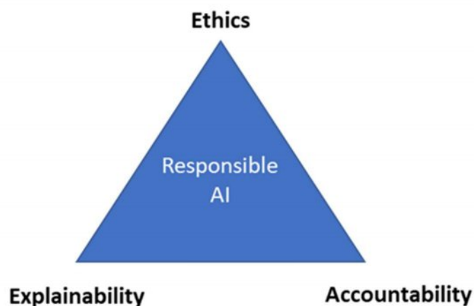
Figure 1: Responsible AI

AI is no different from any other business system; it needs to be built on strong foundations, monitored, tweaked and upgraded to ensure best practice. Three pillars – explainability, accountability, and ethics – establish standards and give organizations the confidence that they are making sound and responsible digital decisions.